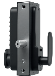
BDGS left hand version shown